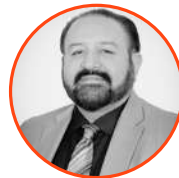
Sunny Punian Syndicate Transport