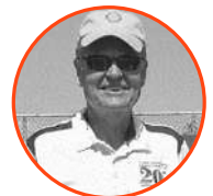
Rod Shopland Night Hawk Truck Lines Inc.